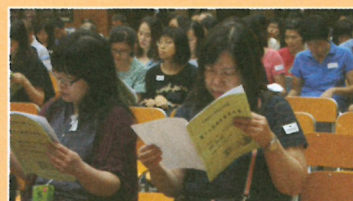
PTA Annual General Meeting