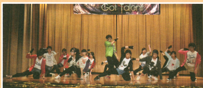
TWGSS' Got Talent - Sing & Dance