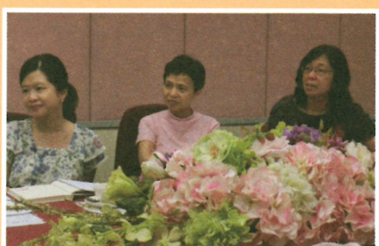
School Visit from Queen Elizabeth School