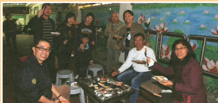
BBQ for TWGSS Alumni