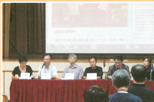
National Education Forum