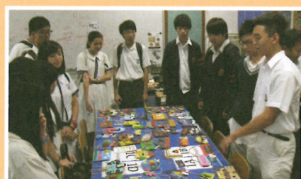
School Visit from NT Heung Yee Kuk Tai Po District Secondary School