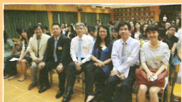
S1 Parents' Sharing Session