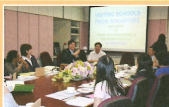
School Visit from Singapore Delegates