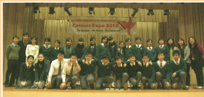
TWGSS Careers Expo