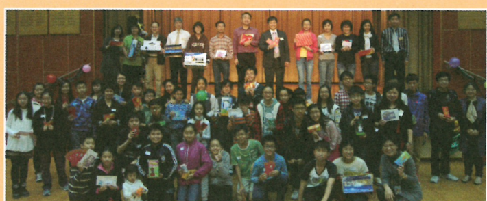
PTA Christmas Party