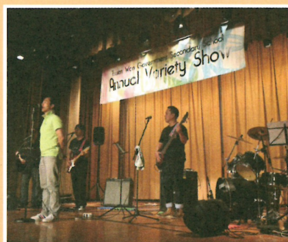
Variety Show 2013