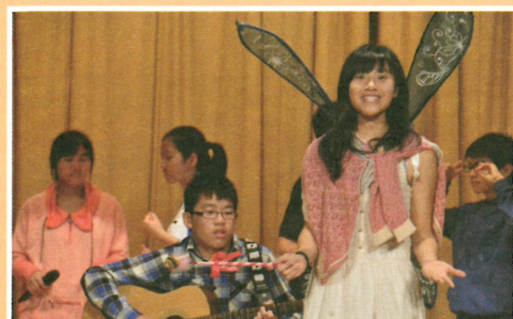
TWGSS' Got Talent - Drama