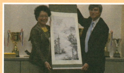
Visit by members from the Standing Committee of Guangdong People's Congress