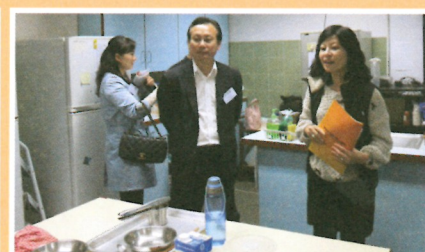
Visit by Officials from Production Safety Control Bureau in Shenzhen Futien District