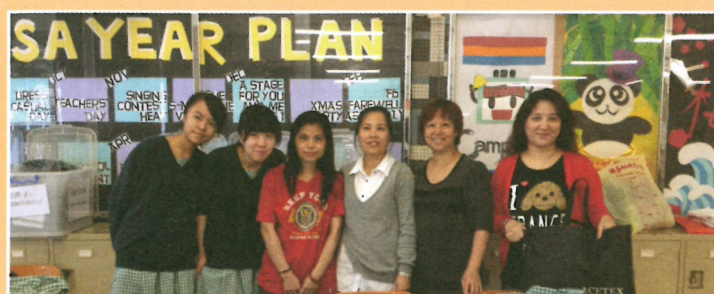
Recycling of School Uniform Campaign