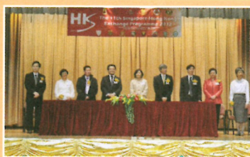
Welcome Ceremony of 11th Singapore-Hong Kong Exchange Programme