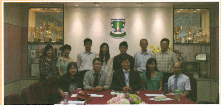
School Visits by Lecturers & Officers from the Universities (HKU, CUHK, HKIEd)