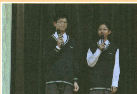
S2 Students' Sharing on School Life