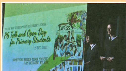
Introduction of P6 Talk Programs