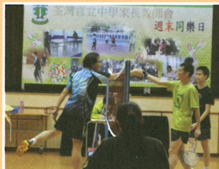
PTA Games Day