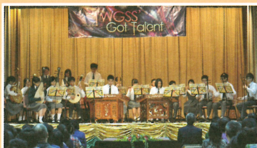
Performance of Chinese Orchestra