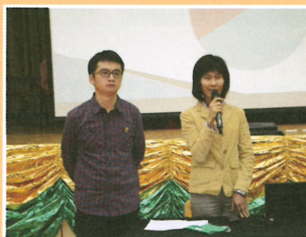
Parents Educational Courses