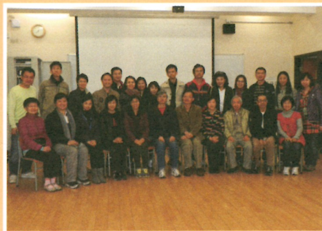
Alumni Association Annual General Meeting