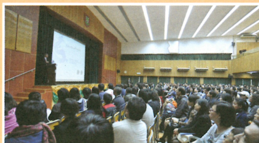
Principal's Presentation on S1 Discretionary Places